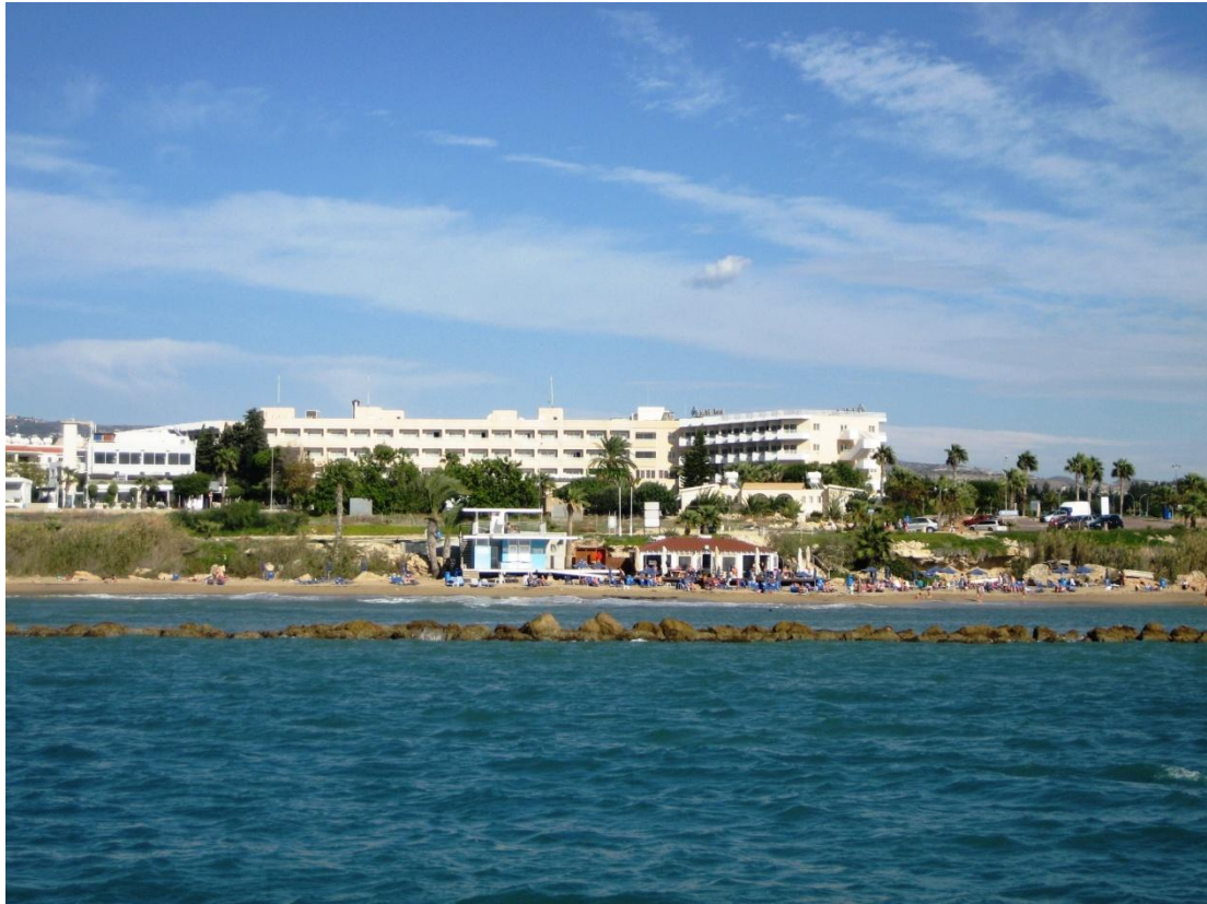
Our hotel in Cyprus and lovely sandy beach.