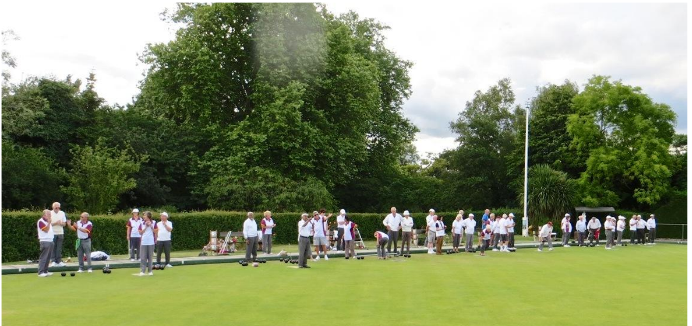
A full green!

In addition they organised the games for 57 people on 7 rinks.