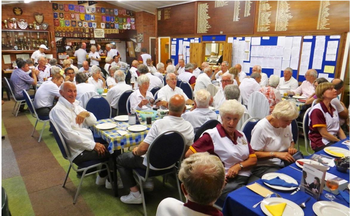
Plenty of business at the bar

In addition they organised the games for 57 people on 7 rinks.