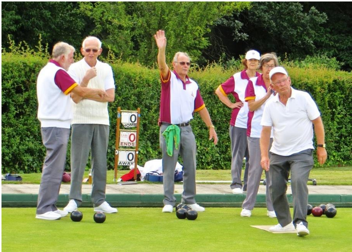
Top rink .....and bottom rink!!