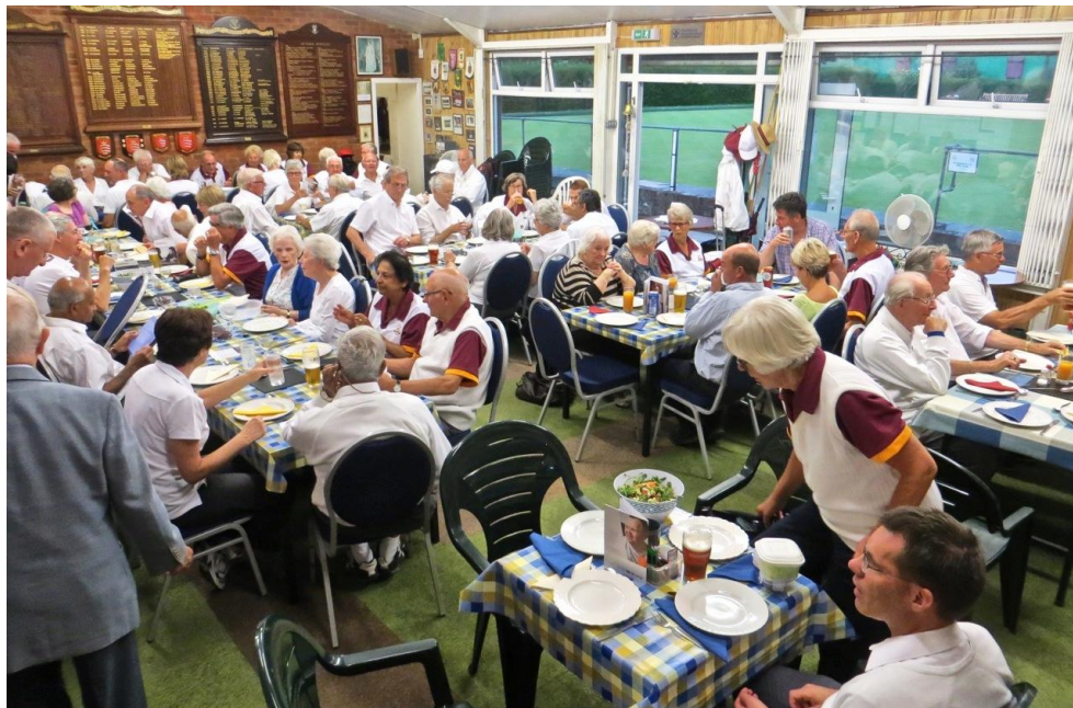
A full house!