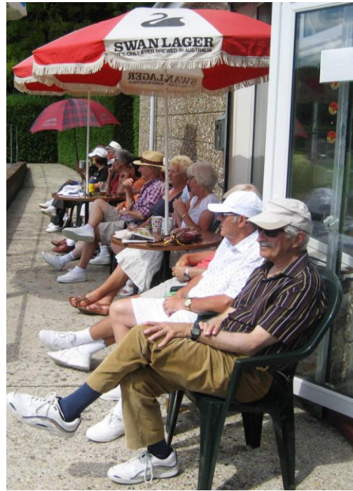
An attentive crowd

Six ends were played in the initial round. There were no markers and the jack was not centred. In the quarter final antique jacks were also used and 8 ends were played. We were blessed with blue skies and very warm conditions, which proved too much for some – well at least for Solo the dog and his master - the reigning champion!