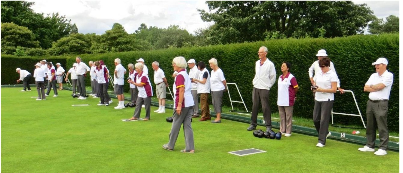
The intelligent members of HBC managed to follow the special rules for the charity match, including bowling woods before jacks!