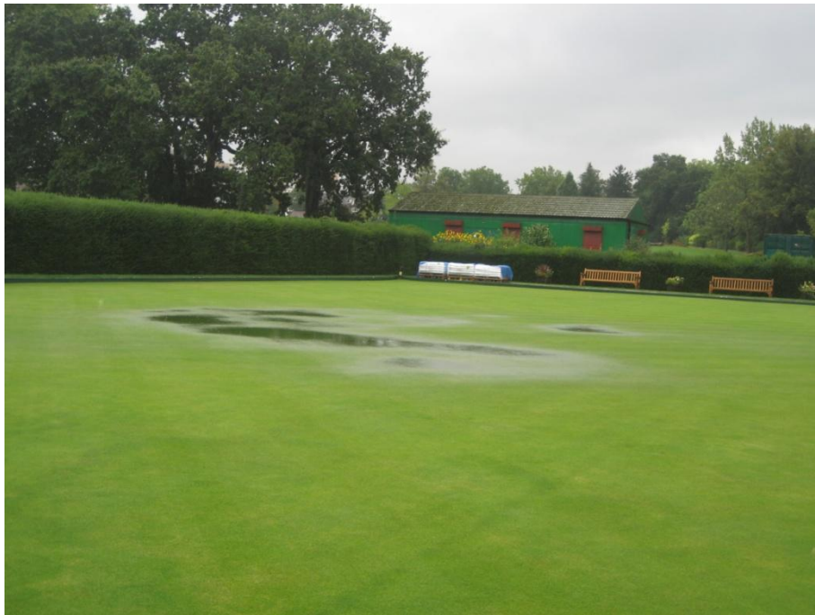
The green at 9.30 am on the morning of Friday 16 th September.

By late afternoon the humidity had resulted in heavy rain, thunder and lightning. Despite these appalling conditions Geoff Thomas and Mark Snell cut the grass in preparation for the Friday Finals day. Without their sterling efforts it would have been impossible to play as scheduled.