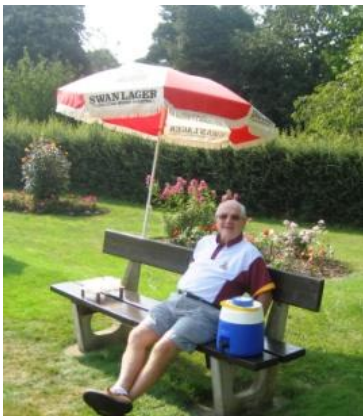
Resting before a match.

The day before finals day was so hot and humid that it was agreed with the opposition, Wealdstone, that only 18 ends would be played for the rinks competition with no trial ends and tea half way through.