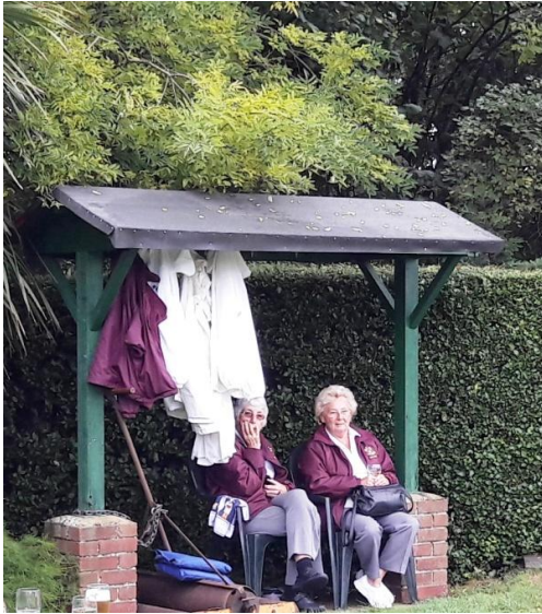
Wags in the VIP seats!

It is testament to the fast draining nature of the green that by 2pm the puddles had disappeared and we were able to put on the first session as planned.