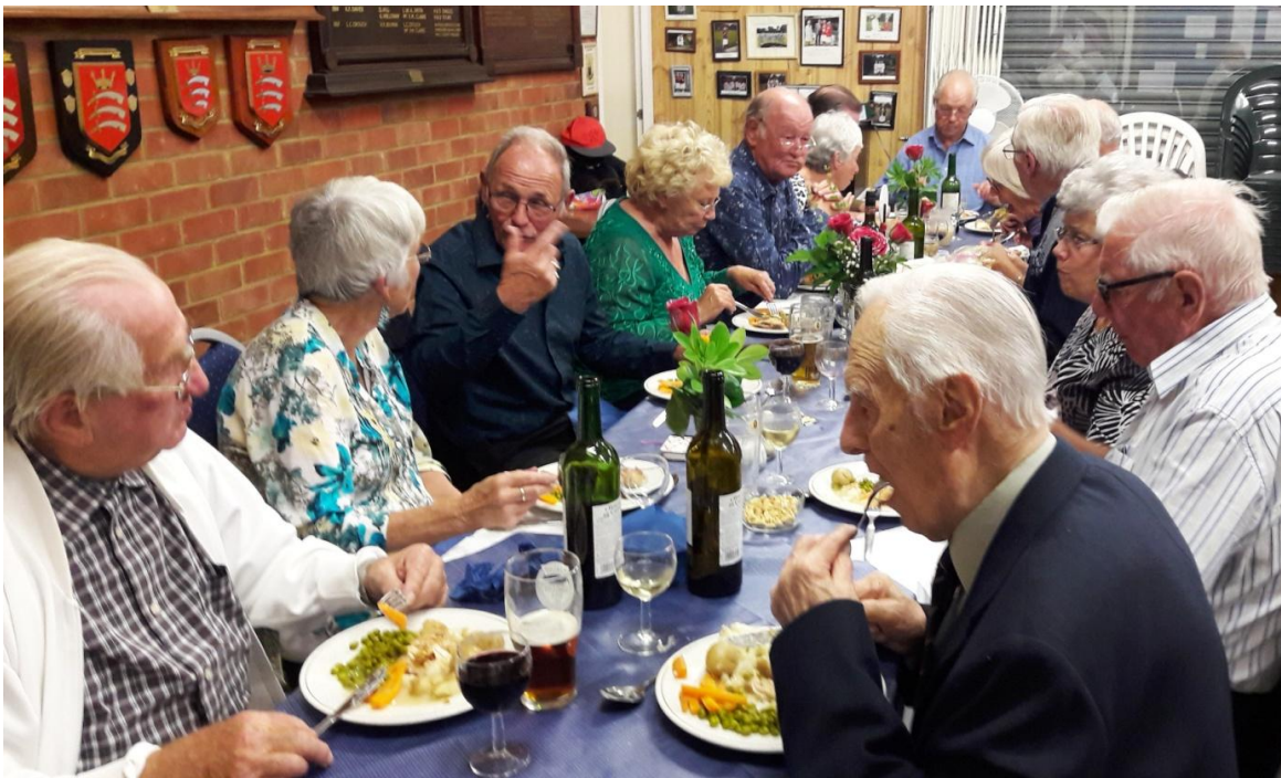
Well, it certainly looked better when it was empty!