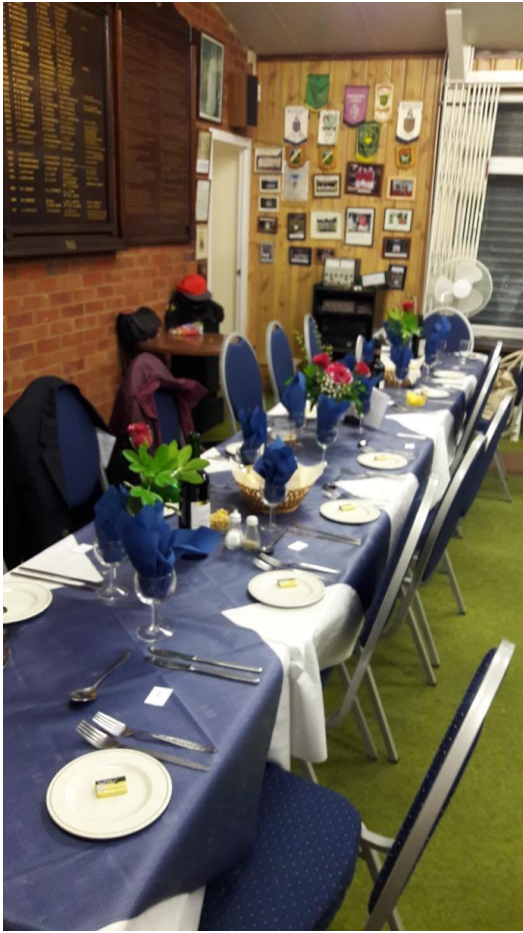
An attractively laid out table