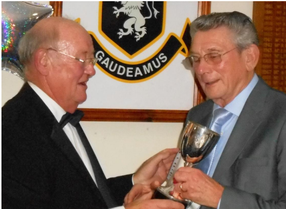
Current President to previous President.