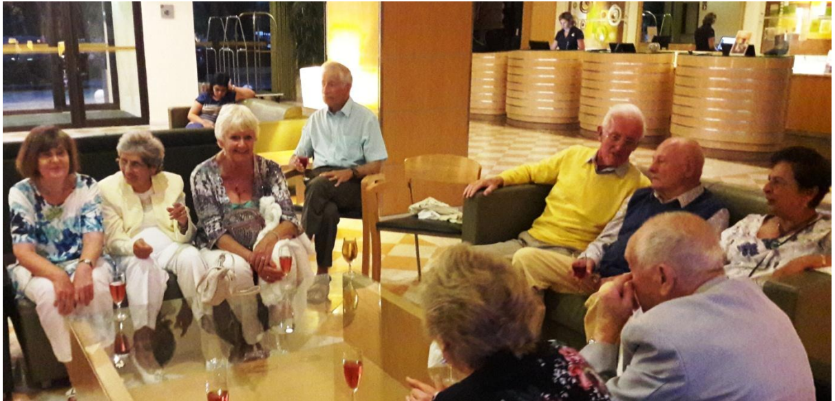
Preparing for the restaurant.