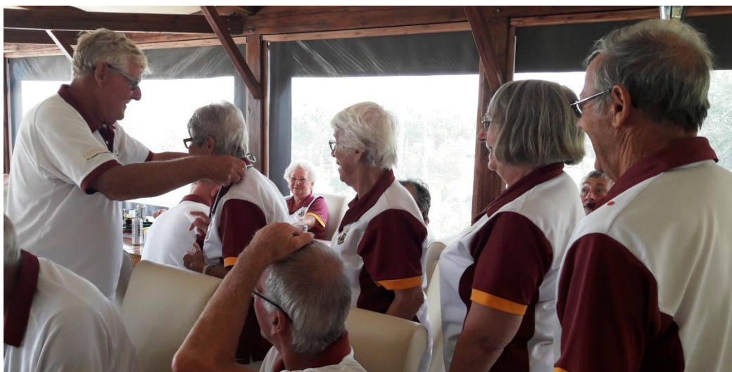
Queuing in truly British style.