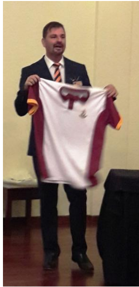
Our latest recruit

Of course this may be the false news that Trump knows all about!