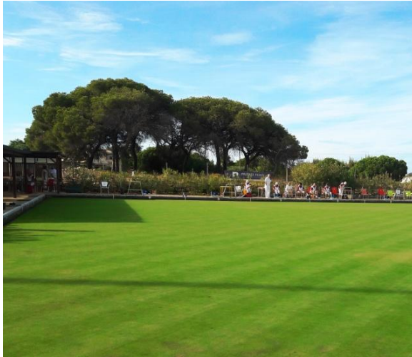
A lovely green

The weather forecast for our 2 nd match was not promising but we were lucky and had perfect bowling weather in a magnificent setting.