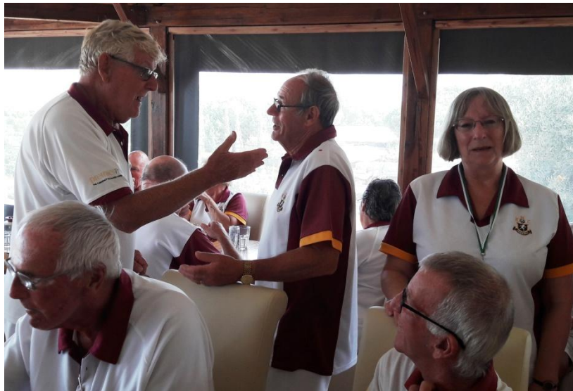
“Congratulations and I insist that you wear it with pride for the rest of the holiday!”