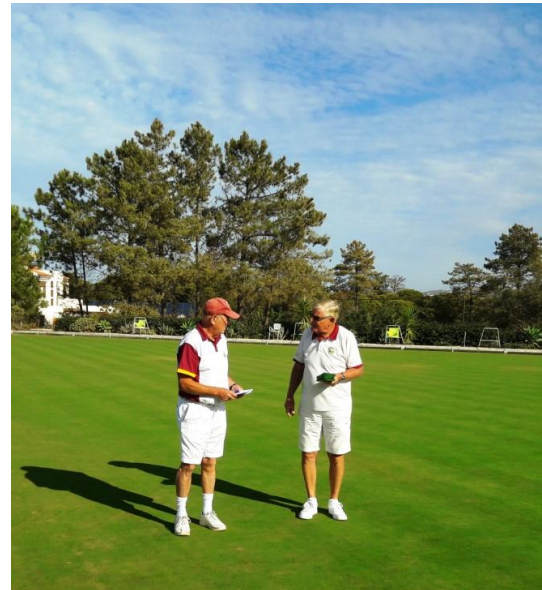
The welcome of the captains