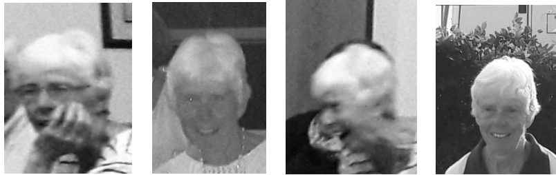
Concentrated Good Naughty Happy