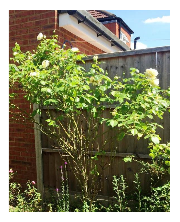
What a year this has been for roses