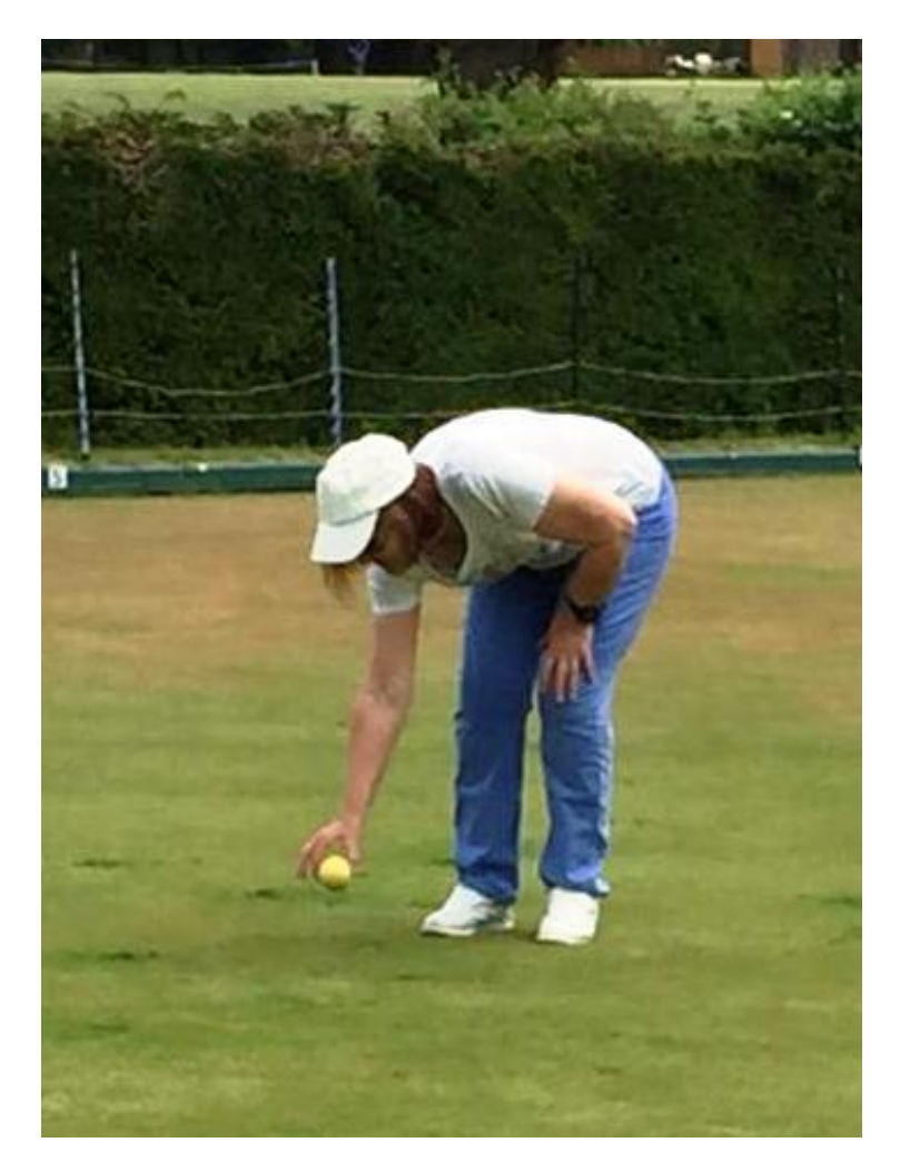
Dare I touch it, I think I can see some viruses on it.