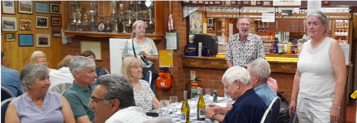
Yet another highly successful social event.