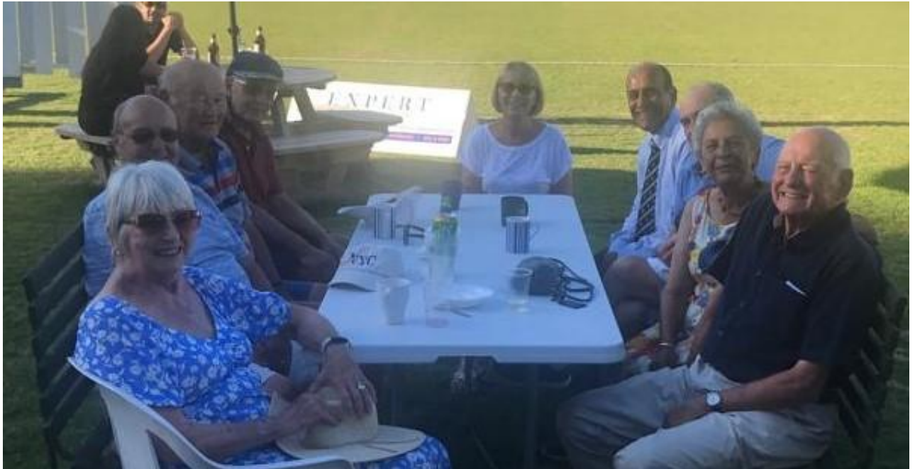
Some clearly particularly enjoyed their day!