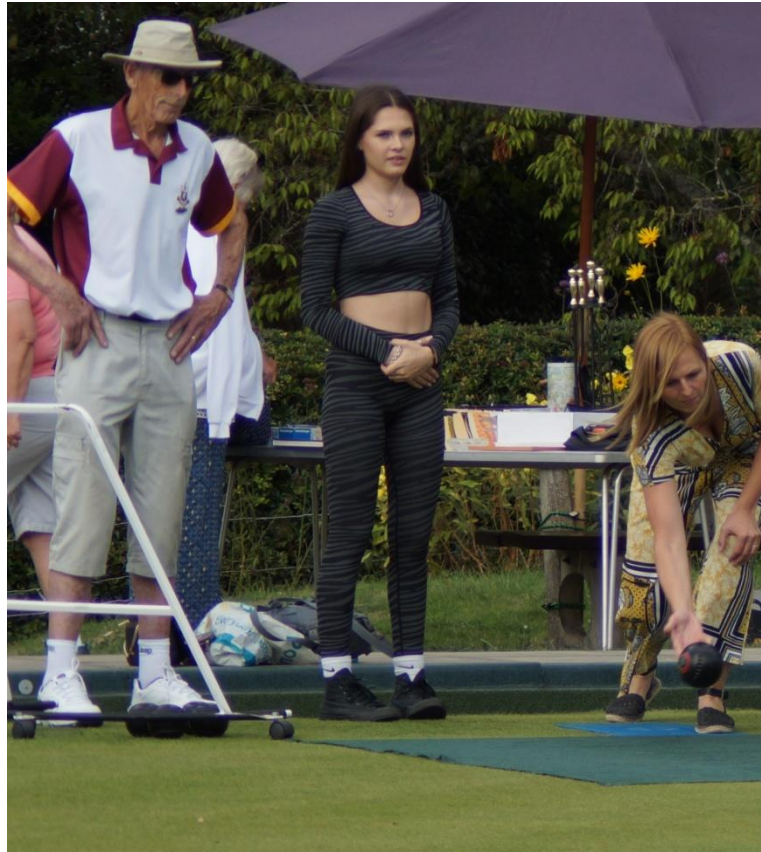
Some visitors with potential came from the south coast!

How did they find us? Who did they come with?