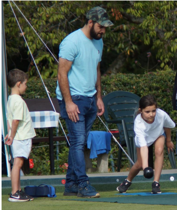
Start them young

There was a chance to try out bowls ...for a small fee.