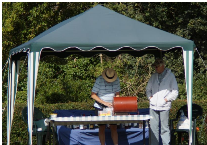
The gazebos had been set up on the Sunday and the tombola tickets organised.