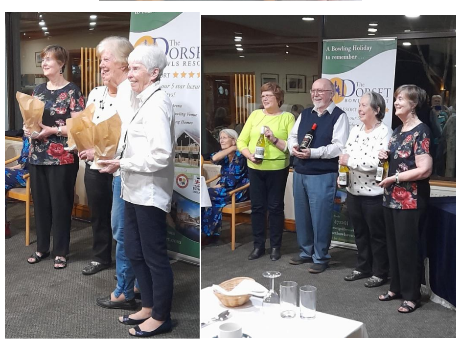
I can't remember why these presentations happened!