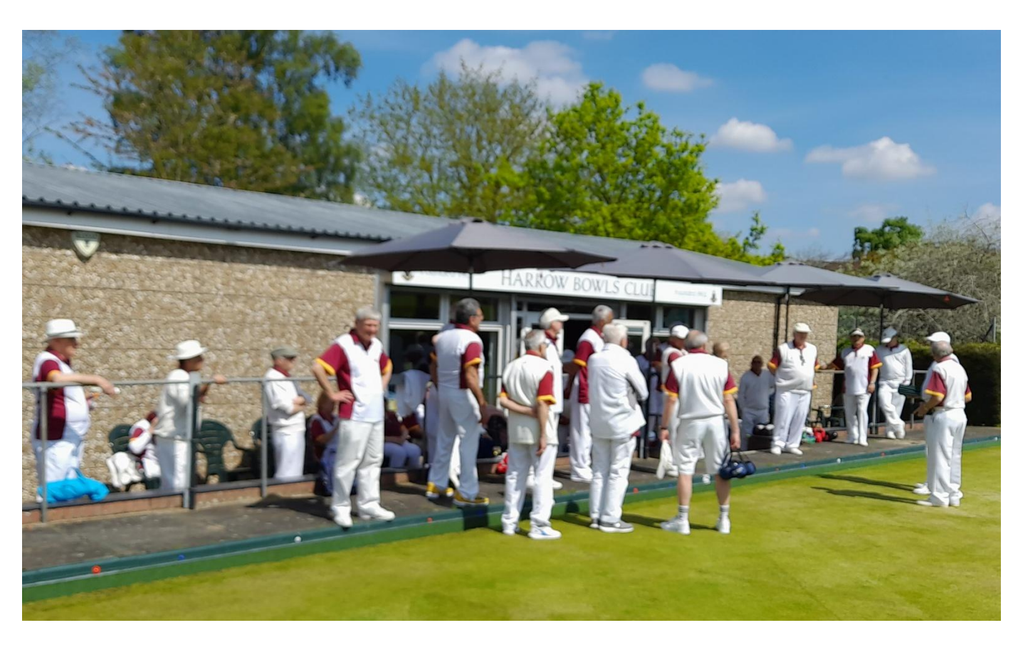
Clearly the captain chose well as his team won 102 shots to 88.