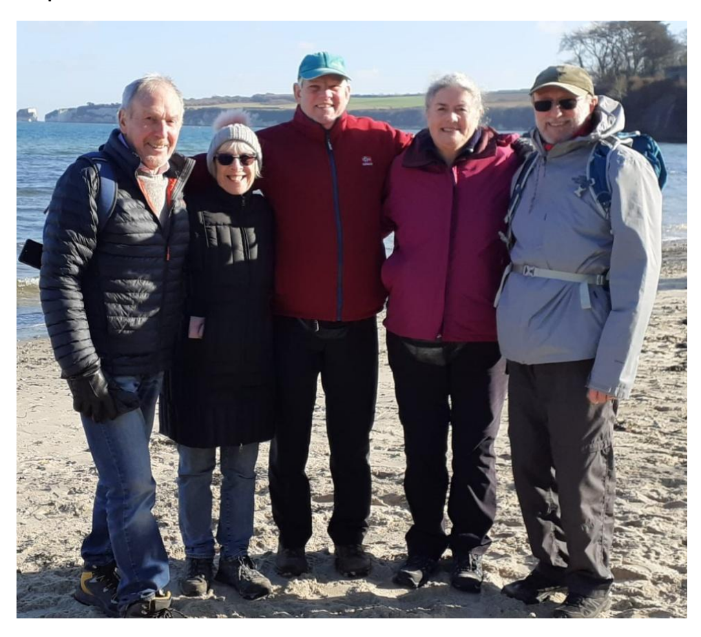
The intrepid crew!

There was plenty to do in the surrounding area although match times caused a problem with these visits.