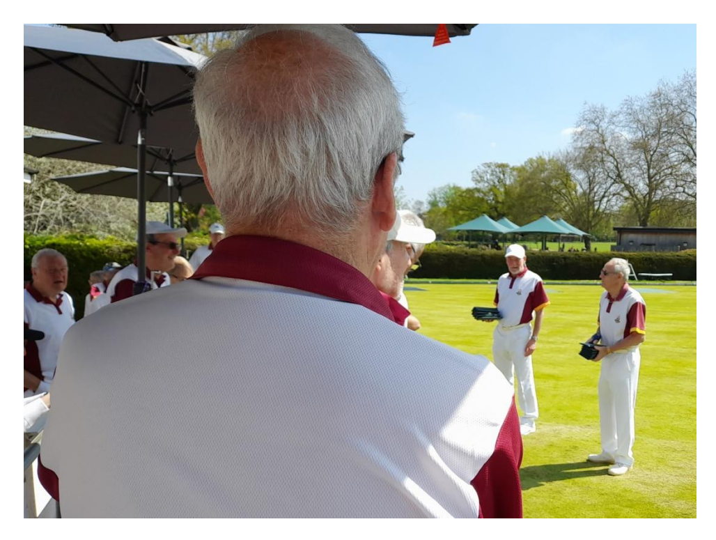
The all important choice!