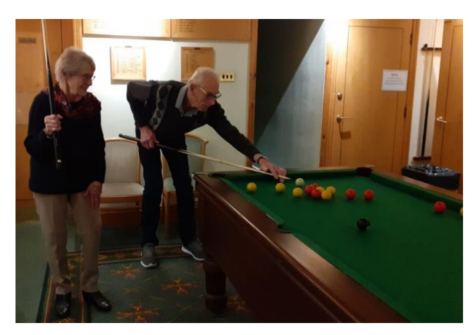
But there were no opportunities to discover their artistic talents unlike Marios at Potters!