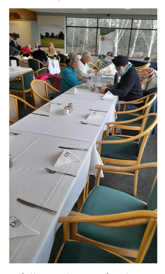
A full complement for dinner