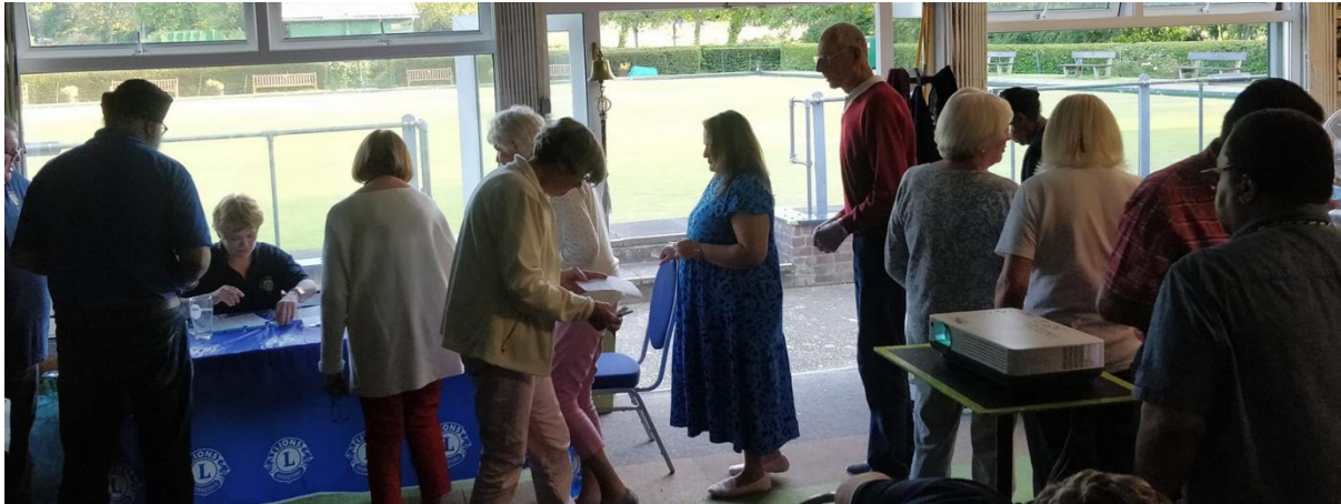
A queue to place a bet.