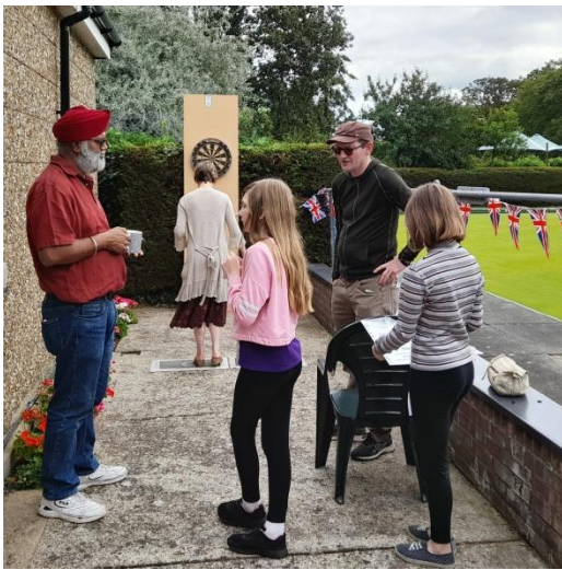
Newer members .....and longer established members were present