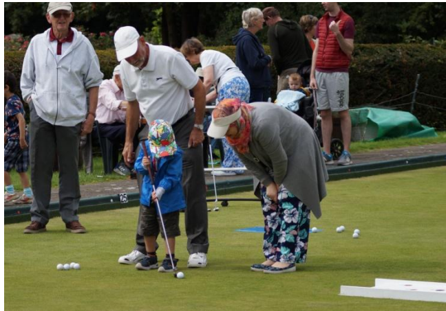
Others tried putting