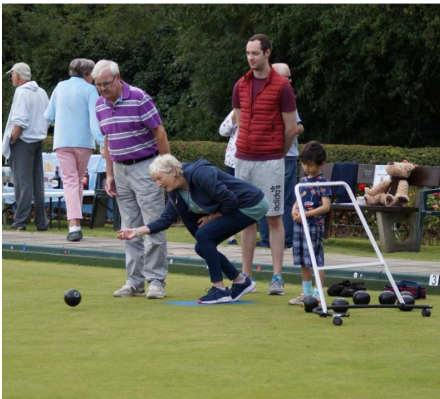
Or had a go at bowling.