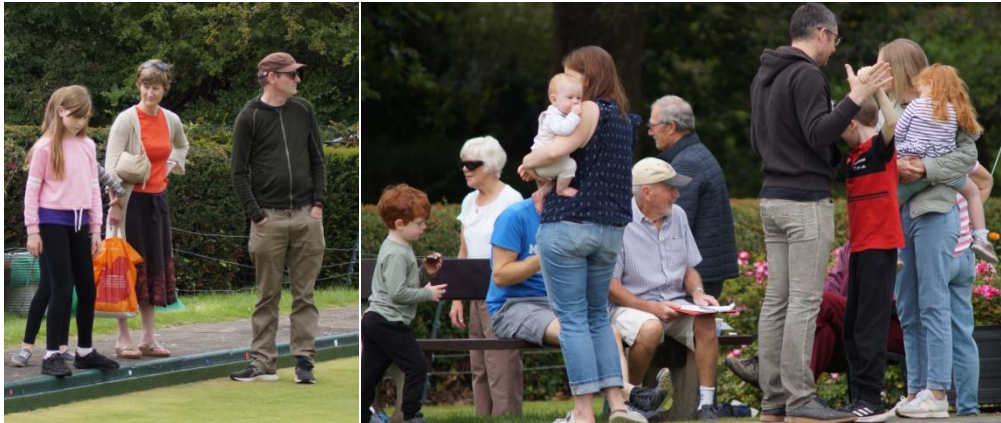
Families gathered to enjoy the activities and to make important purchases.