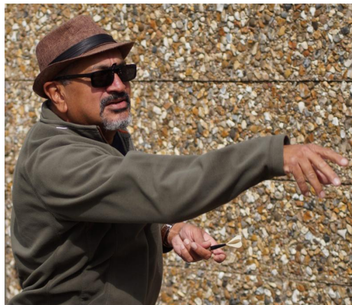
Some showed off their darts action (but didn't win - see later)