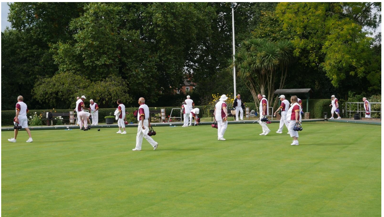
Teams sorting themselves out on the well prepared green.