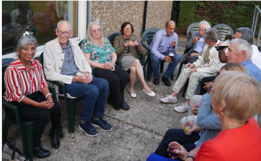
Waiting hopefully for food!