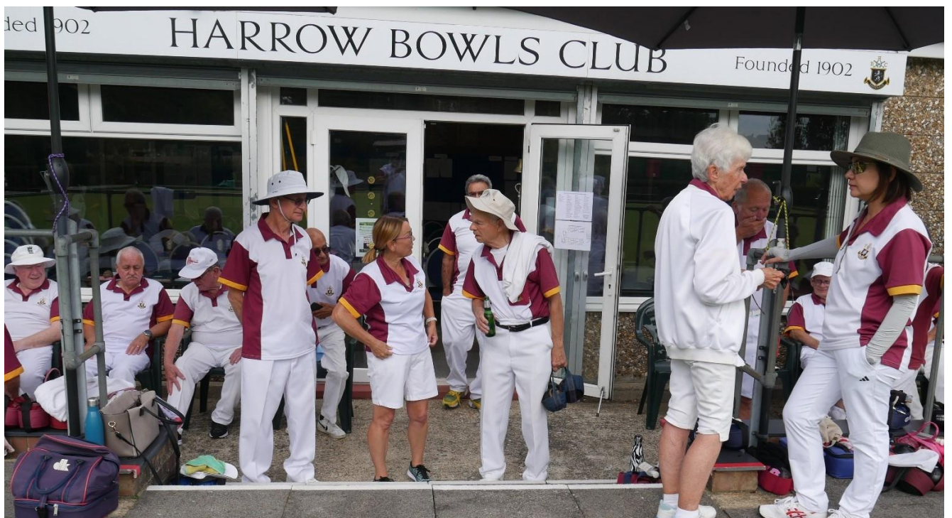
Waiting eagerly to play.