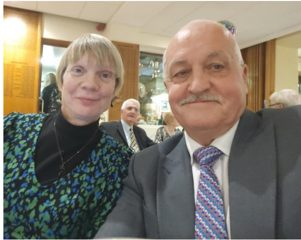
David Bailey himself!